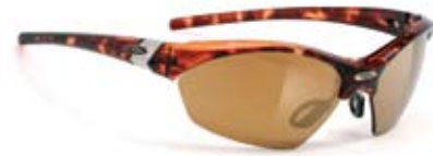
DEMI TURTLE GLOSS SN 04 22 50 | 140 Action Brown lens