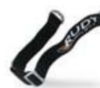
ELASTIC STRAP AC 56 00 04 | 30 Ergonomic strap. Elastic, comfortable and adjustable. Easy to clip-in.