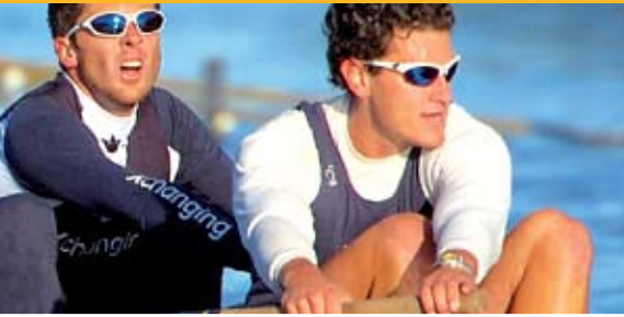
Oxford Rowing Team