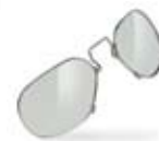
CLIP ON Patented Quick Insert™ Technology FR 76 00 00 | 75