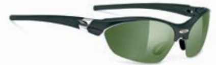
MATTE BLACK SN 04 01 06 G | 140 Racing Red lens + Golf 100 lens