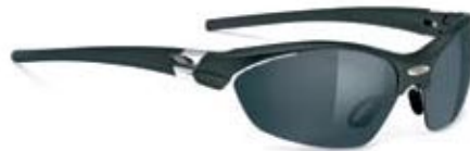
MATTE BLACK SN 04 86 06 | 220 ImpactX™ Polarized Photochromic Grey lens SN 04 81 06 | 170 ImpactX™ Photochromic Clear lens - NEW