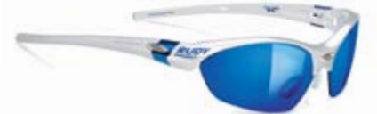
WHITE PEARL SN 04 07 24 R1 | 140 Laser Blue + Racing Red lens